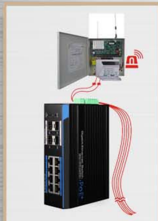
DC Power Failure Warning

Warnings of DC power failure, Cable link down & PoE link down.