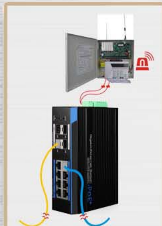
Cable Link Down Warning PoE Link Down Warning