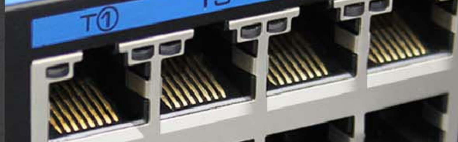
Default PoE of port 1=60W; satisfy power supply of dome cameras

Downlink ports can reach up to 60W maximum power output to satisfy the power supply of high speed dome machine, support 802.3af/at standard. (Default PoE of port 1=60W, able to be configured on web-based management page)